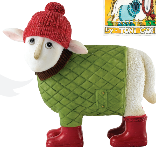
A27700 Grace Height: 9.0cm SRP: £13.00