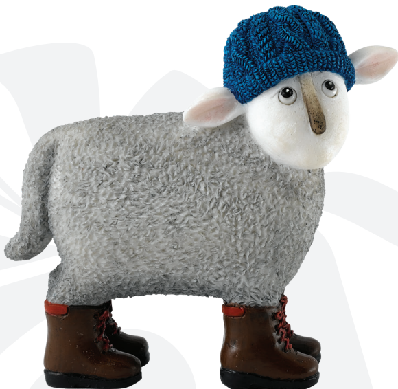
A27701 Duncan Height: 9.0cm SRP: £13.00

All Ewe and Me figurines are packaged in white glossy box with bright logo sticker.