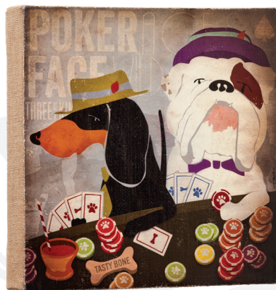
1003050002 Poker Face Burlap Wall Art Size: 30.5cm square SRP: £25.00