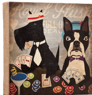
1003050004 Royal Flush Burlap Wall Art Size: 30.5cm square SRP: £25.00