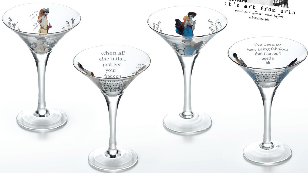
A24725 fabulous Martini Glass Height: 18.0cm SRP: £16.00