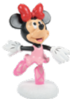
6007178 Minnie's Arabesque Figurine