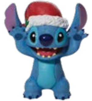
6007133 Christmas Stitch Height: 8.0cm 🎁