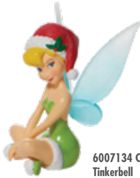
6007134 Christmas Tinkerbell Height: 8.0cm 🎁