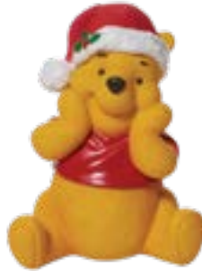
6007132 Christmas Winnie the Pooh Height: 8.0cm 🎁