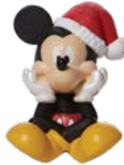
6007131 Christmas Mickey Mouse Height: 8.0cm 🎁