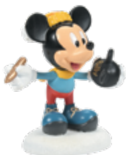
6007179 Mickey's Finishing Touches Figurine