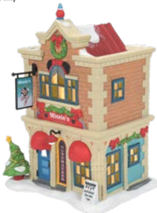
6007176 Minnie's Dance Studio