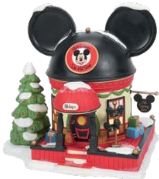
6007177 Mickey's Ear Hat Shop