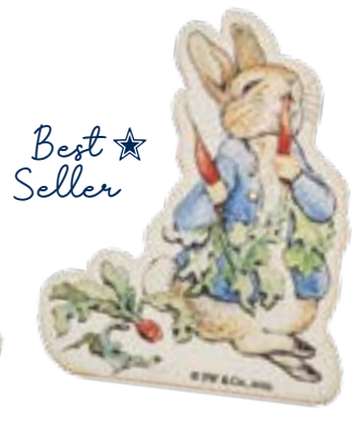
A31847 PETER RABBIT™ WITH RADISHES Height: 7.5cm