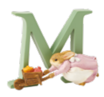
A5005 \mathbf{M} - \mathbf{CECILY} \ \mathbf{PARSLEY}^{\mathsf{TM}} Height: 7.0cm 👚