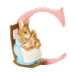
A4995 C — MRS. RABBIT™ AND BUNNIES Height: 7.0cm