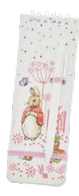
A31694 FLOPSY™ NOTEPAD AND PEN SET Notepad Height: 20.0cm Pen Height: 14.0cm