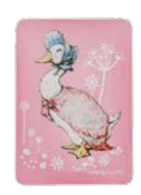
A31767 JEMIMA PUDDLE-DUCK™ MAGNET Height: 6.5cm Glass