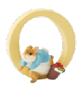
A5007 O — PETER RABBIT™