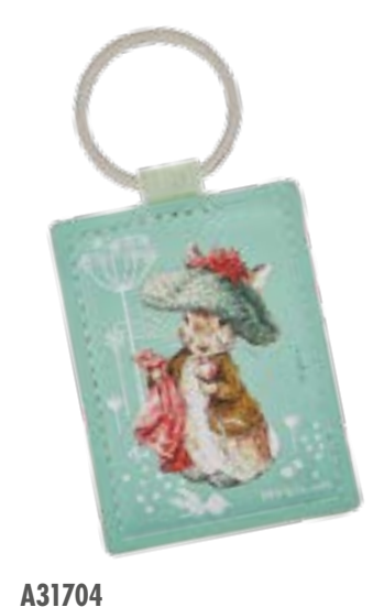
BENJAMIN BUNNY™ KEYRING Height: 9.5cm Faux leather