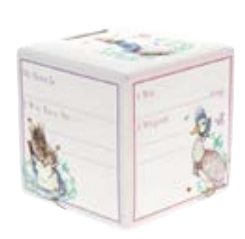
PETER RABBIT ** NEW BABY Height: 9.0cm ** Embossed Character artwork