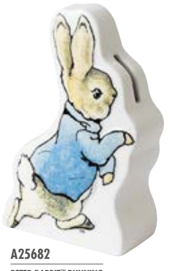
PETER RABBIT™ RUNNING Height: 17.0cm