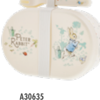
PETER RABBIT™ SNACK BOX AND CUTLERY SET Height: 6.5cm

Cup Height: 6.5cm Fork and Spoon Length: 14.0cm