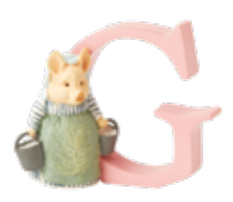
A4999 \mathbf{G} - \mathbf{AUNT} \ \mathbf{PETTITOES}^{^{\mathsf{TM}}} Height: 7.0cm