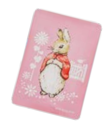
A31764 \textbf{FLOPSY}^{\text{\tiny{TM}}}\,\textbf{MAGNET} Height: 6.5cm