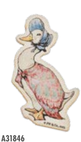
JEMIMA PUDDLE-DUCK™ Height: 7.5cm