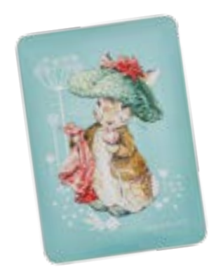
A31766 BENJAMIN BUNNY™ MAGNET Height: 6.5cm Glass