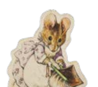
A32265 HUNCA MUNCA™ Height: 7.5cm