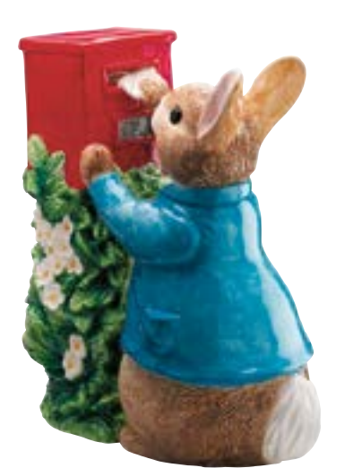
A7170 PETER RABBIT™ POSTING A LETTER Height: 17.0cm →