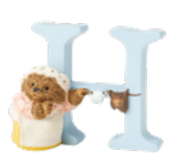
A5000 H-MRS. TIGGY-WINKLE<sup>TM</sup> Height: 7.0cm