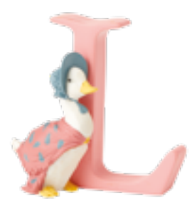
A5004 \mathbf{L} - \mathbf{JEMIMA} \ \mathbf{PUDDLE-DUCK}^{^{\mathrm{TM}}} Height: 7.0cm 👚