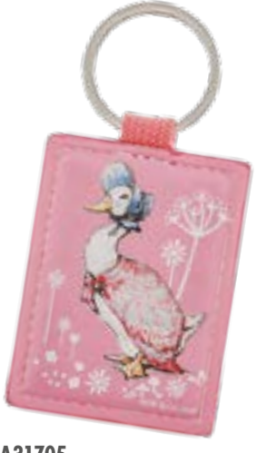
A31705 JEMIMA PUDDLE-DUCK™ KEYRING Height: 9.5cm Faux leather