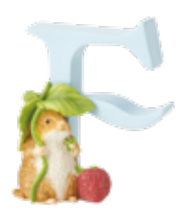
A4998 F — TIMMY WILLIE™ Height: 7.0cm