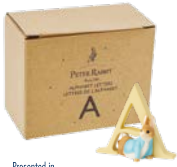
Presented in gift packaging