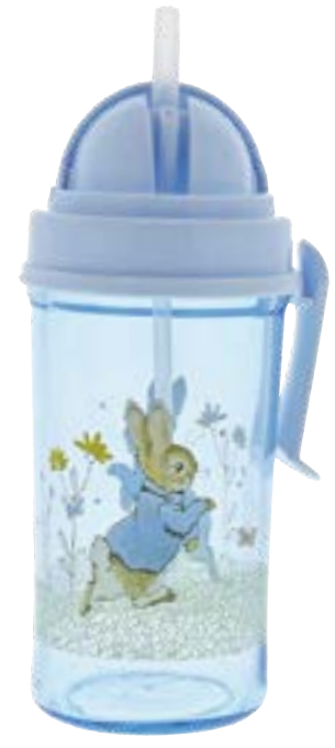
A29186 PETER RABBIT™ WATER BOTTLE Height: 17.0cm Capacity: 9 fl oz/270ml