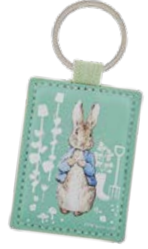
A31702 PETER RABBIT™ KEYRING Height: 9.5cm Faux leather