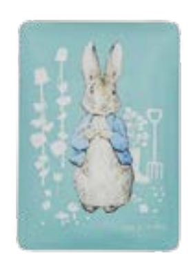
A31765 PETER RABBIT™ MAGNET Height: 6.5cm Glass