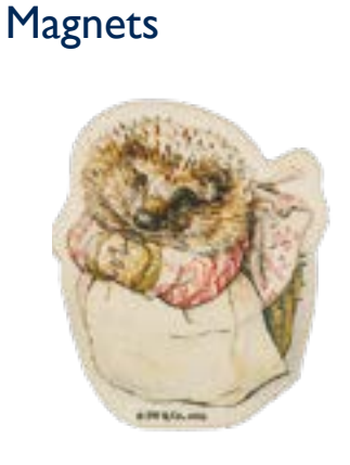
A32267 MRS. TIGGY-WINKLE™ Height: 7.5cm