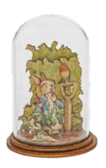
A30446 PETER RABBIT™ WITH RADISHES Height: 8.0cm →