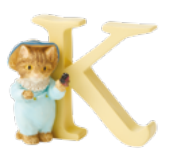
A5003 K-TOM\ KITTEN^{\scriptscriptstyle{TM}} Height: 7.0cm 👚