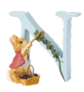
A5006 N-COTTON-TAIL^{TM} Height: 7.0cm 👚