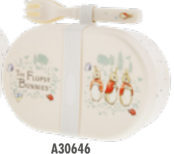
FLOPSY™ SNACK BOX AND CUTLERY SET Height: 6.5cm