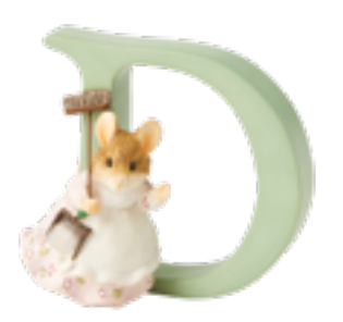
A4996 D — HUNCA MUNCA™ SWEEPING Height: 7.0cm