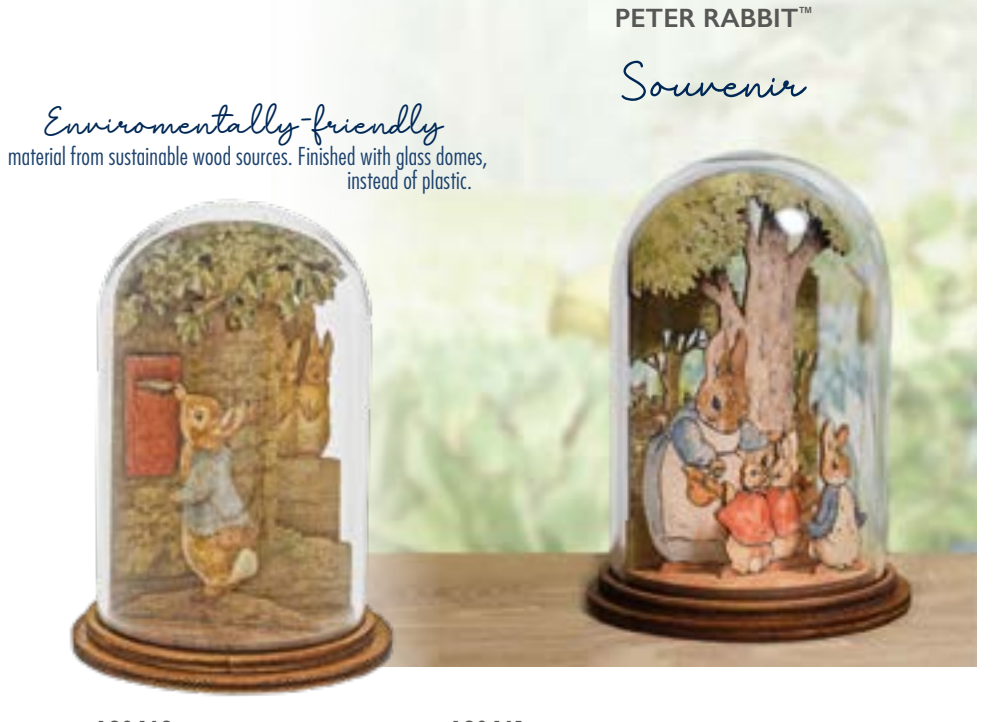
A30463 PETER POSTING LETTER Height: 8.0cm