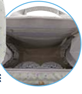
Easy Wipe polyester fabric