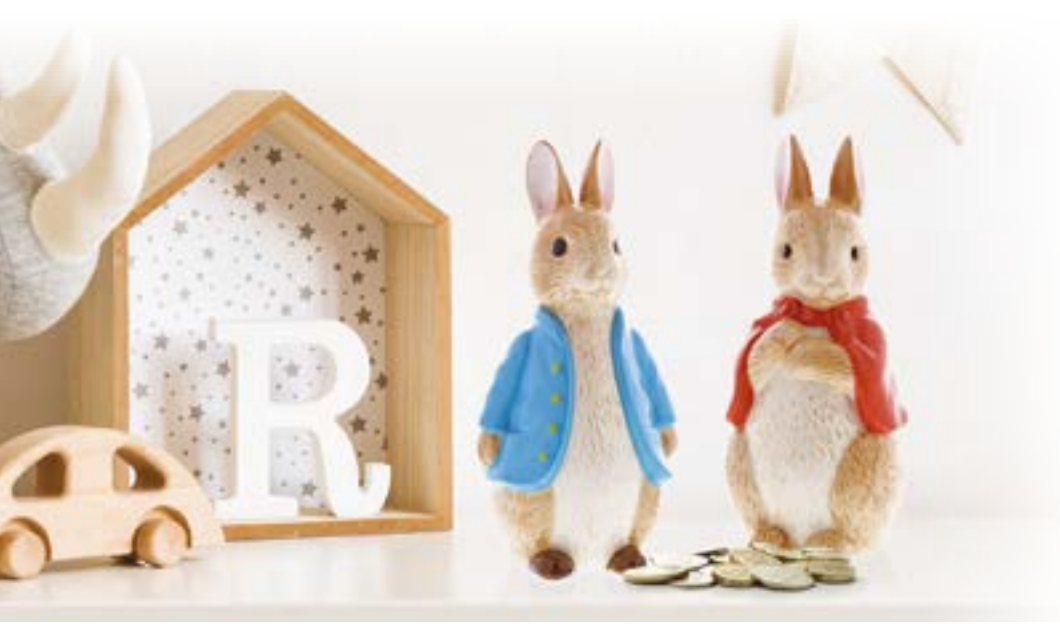
A29292 PETER RABBIT™ SCULPTED Height: 11.5cm ♣