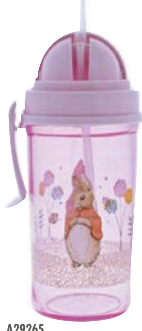
A29265 FLOPSY™ WATER BOTTLE Height: 17.0cm Capacity: 9 fl oz/270ml