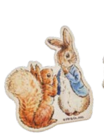
A31848 PETER RABBIT™ AND SQUIRREL NUTKIN™ Height: 7.5cm