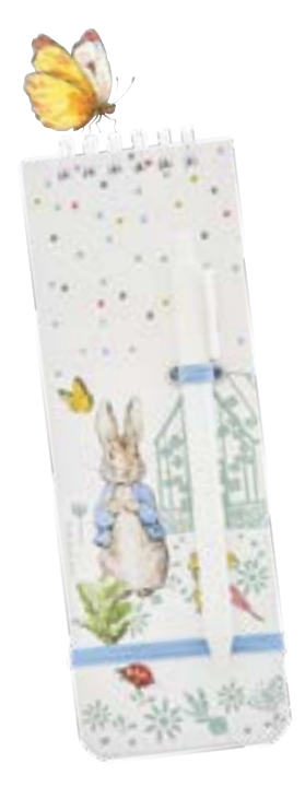
A31693 PETER RABBIT™ NOTEPAD AND PEN SET Notepad Height: 20.0cm Pen Height: 14.0cm