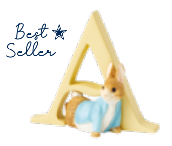
A4993 A — PETER RABBIT™ Height: 7.0cm