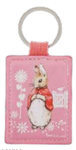
A31703 FLOPSY™ KEYRING Height: 9.5cm Faux leather