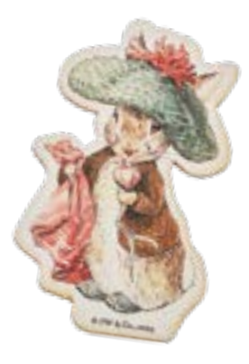
A31845 BENJAMIN BUNNY™ Height: 7.5cm