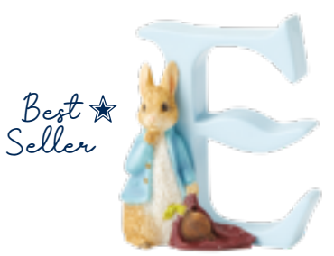
A4997 \mathbf{E} - \mathbf{PETER} \; \mathbf{RABBIT}^{\mathsf{TM}} \, \mathbf{WITH} \; \mathbf{ONIONS} Height: 7.0cm 👚