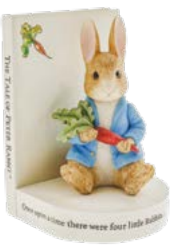
A31059 PETER RABBIT™ BOOK STOP Height: 16.0cm →