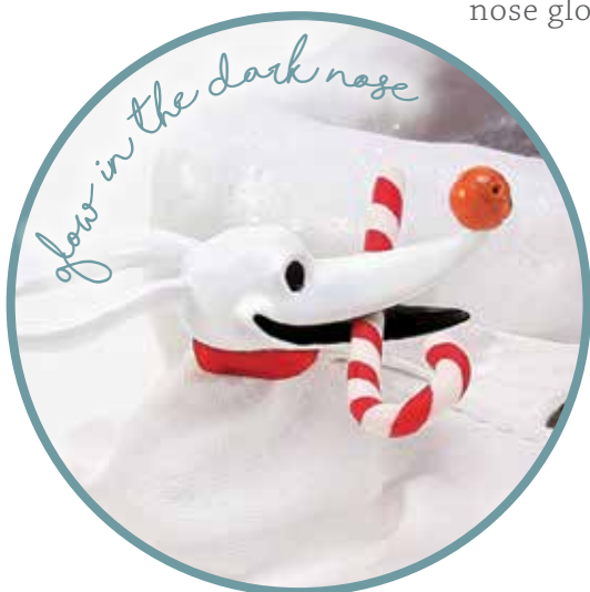
6000810 Jack and Zero Deliveries

Pumpkin King Jack Skellington strides across the rooftops, unaware that his idea of Christmas will not be quite what is expected! Jack and Zero Deliveries captures the essence of the scene perfectly. Zero's pumpkin nose glows in the dark too!