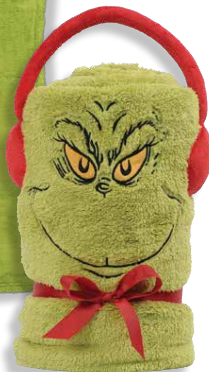
6003284 Grinch SnowThrow™

Size: 122.0cm x 150.0cm (Rolled up: 38.0cm x 23.0cm)