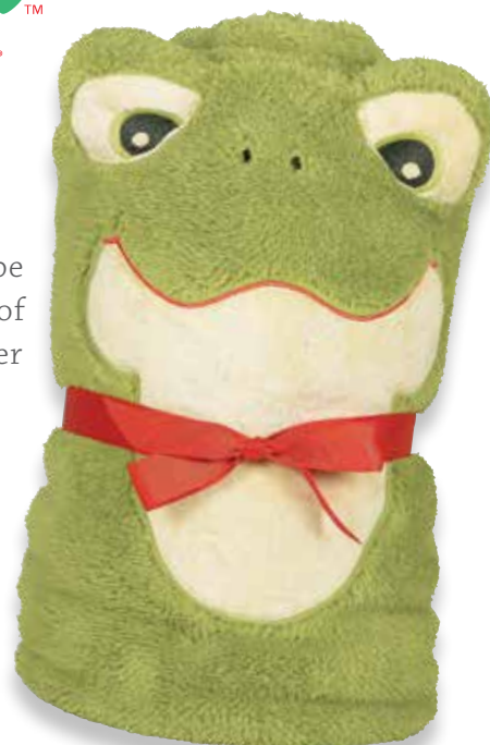
6004985 Frog SnowThrow™

THESE soft AND cuddly SNOWTHROWS™ ARE JUST AS SWEET ROLLED UP AS THEY ARE WRAPPED AROUND A LOVED ONE!