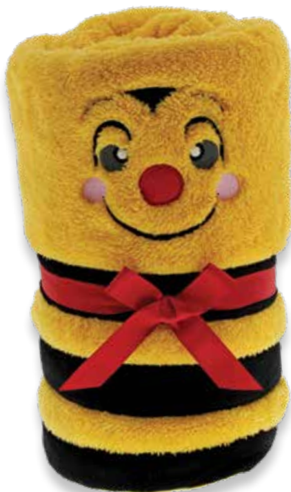
6004986 Bumble Bee SnowThrow™

Guaranteed to keep anyone cosy on a cold winter evening, these NEW additions to our range of SnowThrows™ are just begging to be hugged! Made from a combination of sherpa and coral fleece, they're super soft and designed in various cute styles.