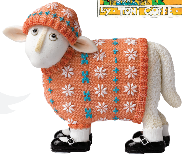
A27063 Poppy Height: 9.0cm SRP: £12.00

© 2015 Toni Goffe. Washington Green Licensing.