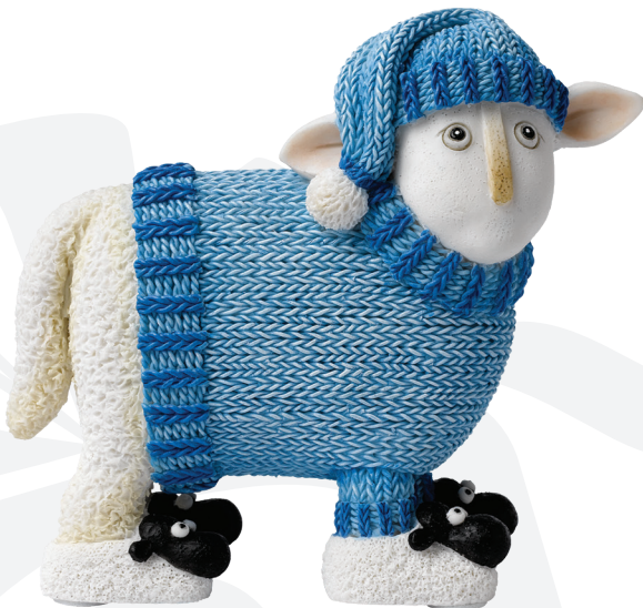
A27064 Jacob Height: 9.0cm SRP: £12.00