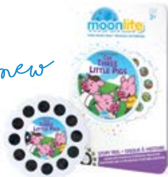
6051214 Moonlight Story Reel Three Little Pigs Height: 15.0cm 📦