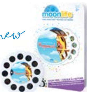
6054015 Moonlight Story Reel Rapunzel Height: 15.0cm 📦