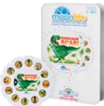
6045735 Moonlight Story Reel Dinosaur Roar Height: 15.0cm 📦