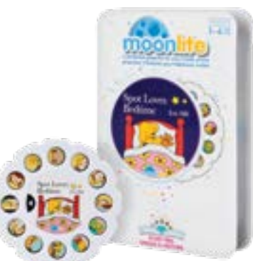
6045734 Moonlight Story Reel Spot Loves Bedtime Height: 15.0cm 📦