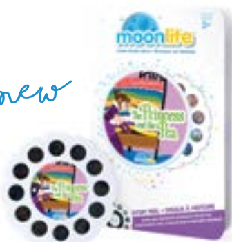
6051216 Moonlight Story Reel The Princess and the Pea Height: 15.0cm 📦