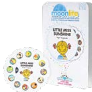
6045748 Moonlight Story Reel Little Miss Sunshine Height: 15.0cm 📦