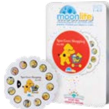
6046427 Moonlight Story Reel Spot Goes Shopping Height: 15.0cm 📦