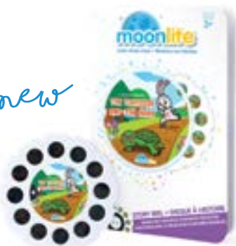
6054018 Moonlight Story Reel The Tortoise and the Hare Height: 15.0cm 📦