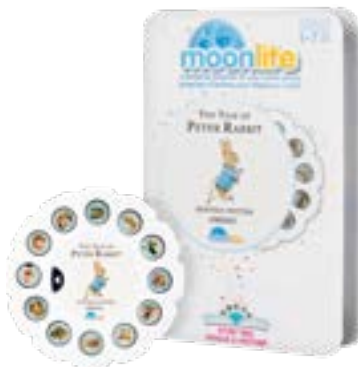
6043711 Moonlight Story Reel The Tale of Peter Rabbit Height: 15.0cm 📦