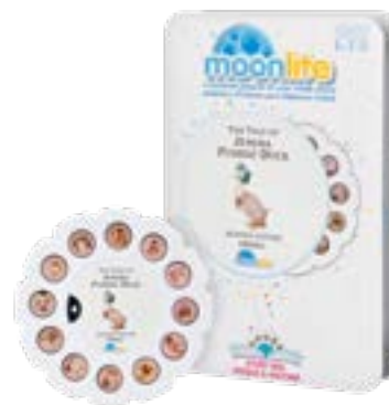
6043092 Moonlight Story Reel The Tale of Jemima Puddle-Duck Height: 15.0cm 📦