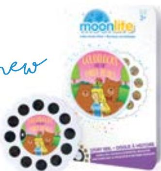
6043712 Moonlight Story Reel Goldilocks and the Three Bears Height: 15.0cm 📦