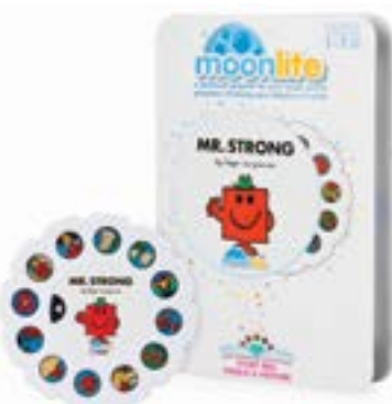
6045747 Moonlight Story Reel Mr Strong Height: 15.0cm 📦